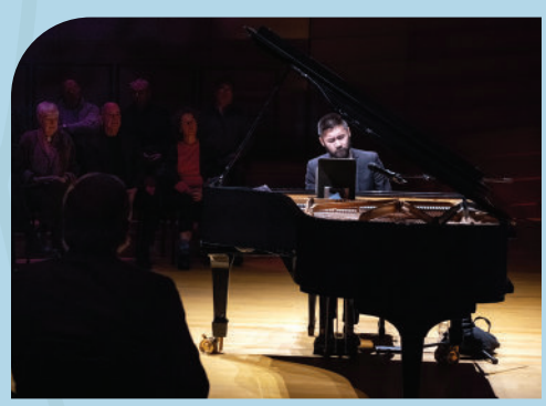
Conrad Tao, piano