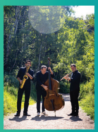
FAMILY SERIES SPONSORED BY

Sonic Time Travel with Project Trio FAMILY CONCERT SUNDAY, MARCH 2 AT 2 PM