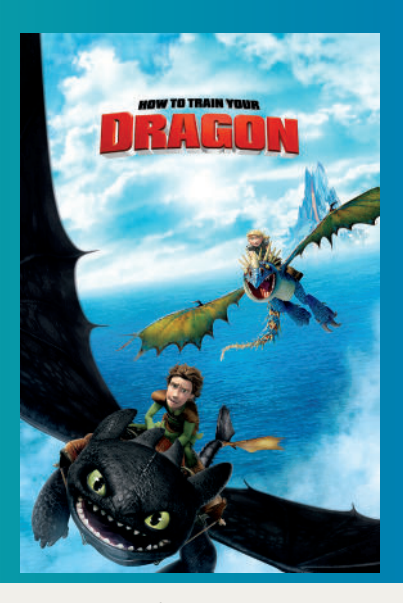
How to Train Your Dragon™ in Concert FILM + LIVE ORCHESTRA MARCH 7-9 | 4 PERFORMANCES