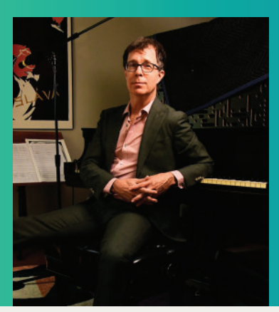
Ben Folds with the KC Symphony SPECIAL PERFORMANCES TUESDAY, MARCH 18 AT 7 PM WEDNESDAY, MARCH 19 AT 7 PM

Sonic Time Travel with Project Trio FAMILY CONCERT SUNDAY, MARCH 2 AT 2 PM